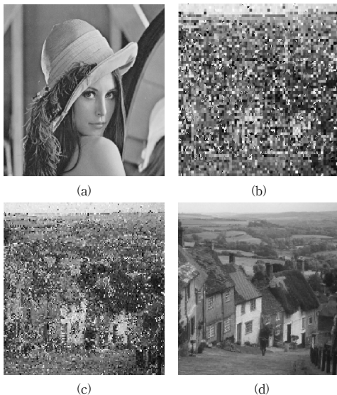
[Fig. 2] IFS coding images (a) Initial Image (b) iteration number = 1 (PSNR=12.40 dB) (c) iteration number = 2 (PSNR=14.71 dB) (d) iteration number = 16 (PSNR=32.37 dB)

To verify the proposed IFS image coder we use the optimal solution with the brightness and contrast variation.