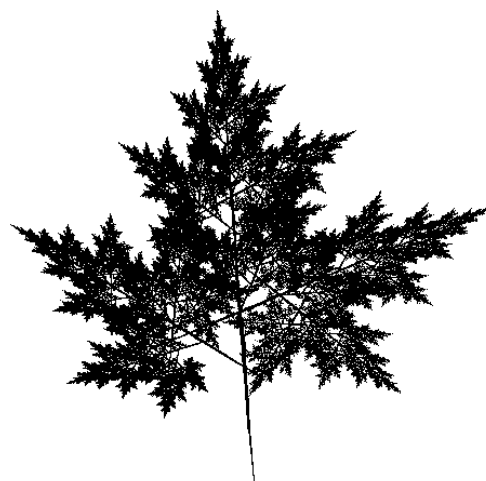
[Fig. 1] IFS image generation (iteration number=2,000,000)

The square support of the original digital image is